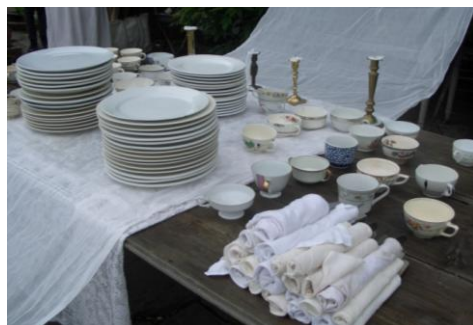
Town and Country Dinner 2010 at Mildred's Lane.